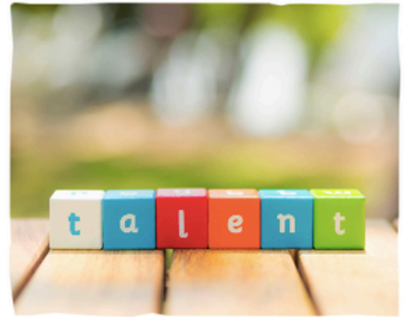
Talent & Expertise