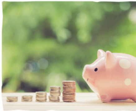
Donor Advisor Funds