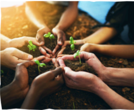
Cash & Checks

We also accept non-cash gifts like real estate, stock, crypto, and tangible property.